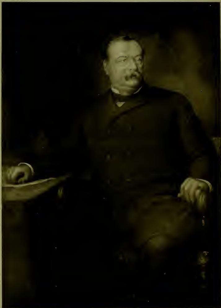
Bravure. Andersen. Lamb. Co. N.Y.